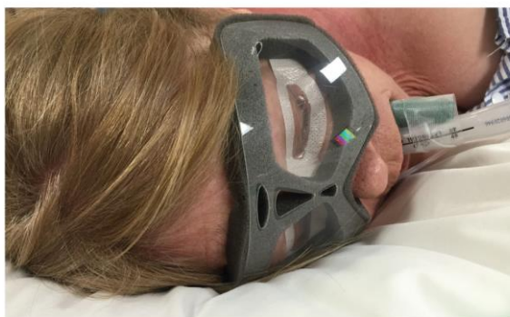
Patient with NoPress, also wearing EyePros (by Innovgas) to maintain eyelid closure.

NoPress™ is a foam and rigid plastic shield designed specifically to protect anaesthetised patient's eyes from externally applied pressure. It's patented unitary design and midline flexion device means it resists a high pressure load while still conforming to the patient's face.